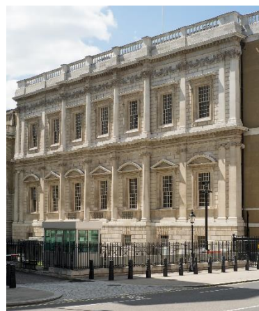
The Banqueting House, Whitehall, London

Our experience spans over 35 years and covers a wide range of ecclesiastical buildings, historic sites and monuments. We operate both as a main contractor and a specialist sub-contractor on site, with work executed by our highly skilled team of masons, carvers and conservators; we also have a dedicated team of rope access conservators. We offer surveying and conservation report writing services to inform specifications of work or support grant funding applications. As a main contractor we have a proven track record of working collaboratively with clients, consultants, and specialist sub-contractors to deliver successful projects on site. As a specialist sub-contractor, we undertake complex conservation specifications including the cleaning, consolidation, structural and conservation repair of historic fabric. We bring professional accreditation (ICON) and are dedicated to the training and development of our workforce to ensure the highest quality of work and to meet all current health and safety standards.