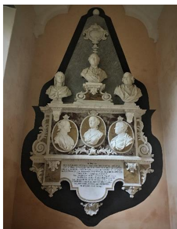
Newman Monument, St Mary Magdalen Church, Fifehead Magdalen