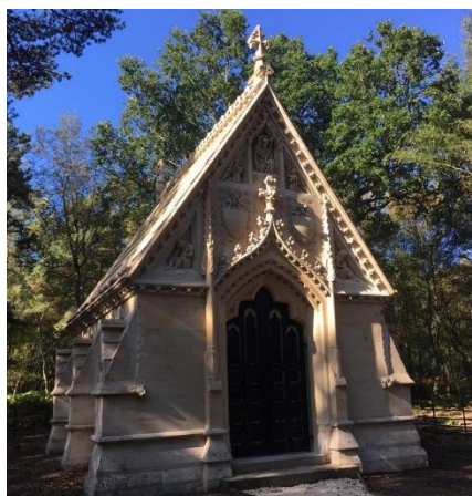
Colquhoun Chapel, Brookwood Cemetery

Sally Strachey Historic Conservation are award-winning specialists in the repair and conservation of historic fabric across a range of projects including architectural stonework, archaeological sites, museum pieces, church monuments, historic plaster and render, sculpture, polychrome and decorative surfaces. As a team of skilled craftspeople and consultants, we always aim to deliver excellence in our work. Our guiding principles are care and respect for the historic fabric, and a strong passion for heritage. We have evolved as a company to develop ways of working with our clients that uphold this ethos whilst also meeting the programme and budgetary constraints of any project. We are based in the South West but have site teams working across the South and South East, London, the Midlands, Wales and further afield.