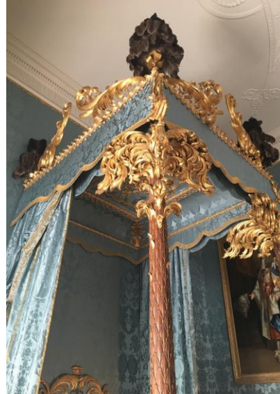
Kedleston Hall State Apartment