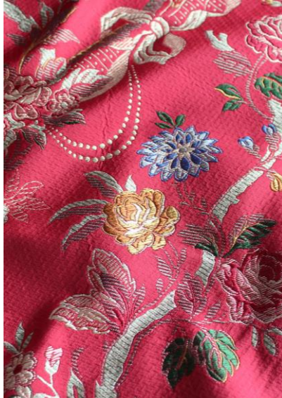
Lace Boquete Multi Colour Tissue