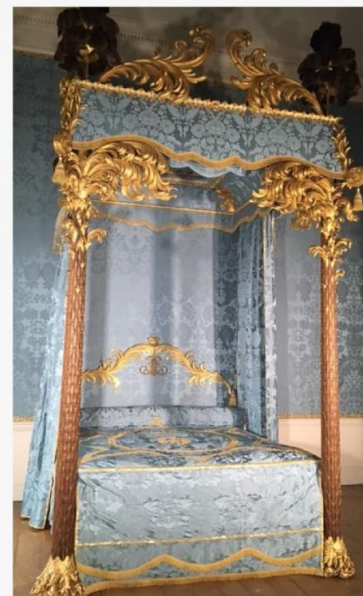
Kedleston Hall State Bed

At Heritage we specialize in the reproduction of historic passementerie. Having been involved in the most important of historic projects both in this country and internationally we have built up a reputation for accuracy and excellence in this field, and are now considered to be amongst the very best in the world for the remaking of this fabulous passementerie. Whether an intricate jacquard lace in gold thread, or an elaborate tassel with the most sumptuous silk finish, Heritage can do it all to the highest of standards.