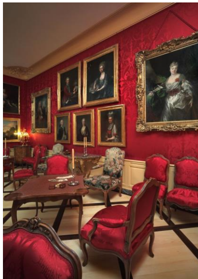
Crimson Pure Silk, Chateau de Prangins, Switzerland