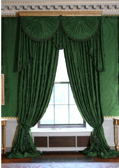
Hillsborough Castle, (Above & Right.)