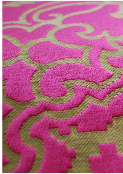
Silk & Linen Brocatelle, Palace of Westminster