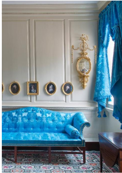
Silk & Wool Damask Mount Vernon, Washington