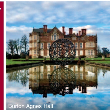
Burton Agnes Hall

There will be live demonstrations of practical skills and conservation techniques.